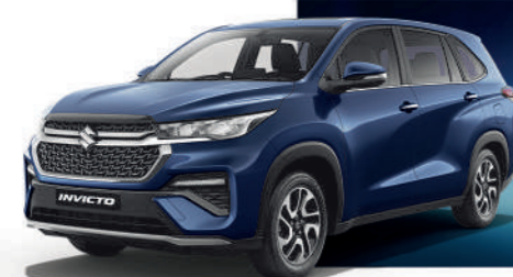
NEXA BLUE (CELESTIAL)